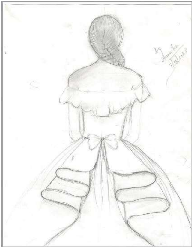
A pencil drawing and painting by Anamika Anil