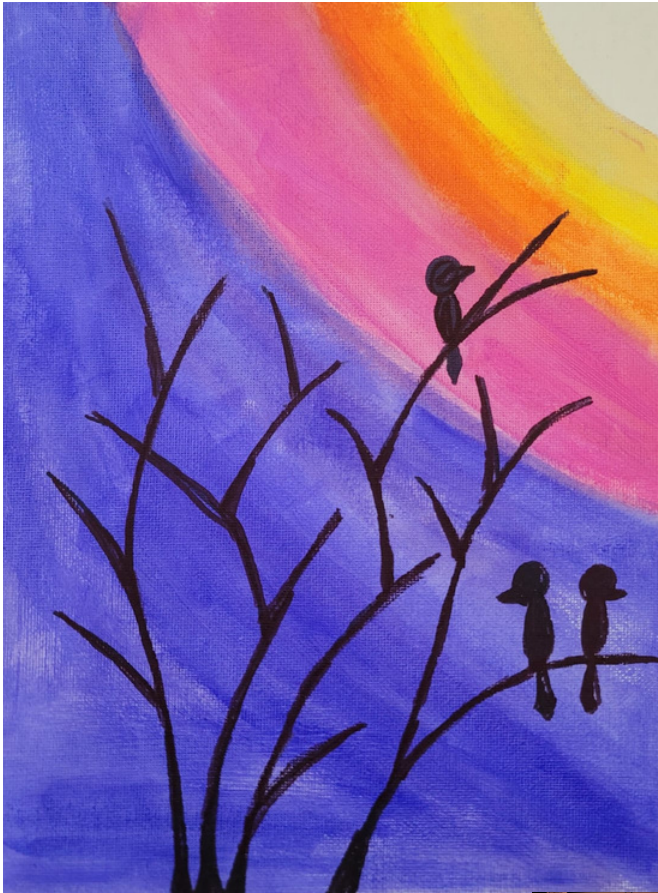
Nitha Nithin Grade : 5