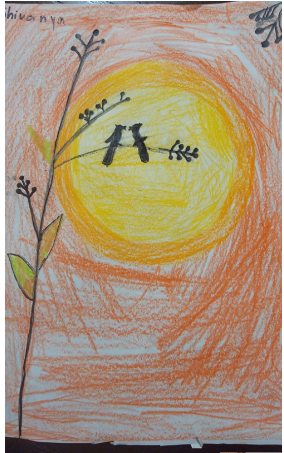
Shivanya Prajeesh Grade : 1